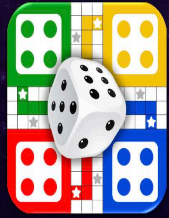
Ludo Board Game